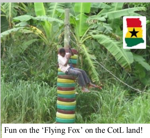
Fun on the 'Flying Fox' on the CotL land!

Feeling Blessed! Special thanks to Frankie's Restaurant and Extra Mile, Ghana, for this new laptop. (Photo left)